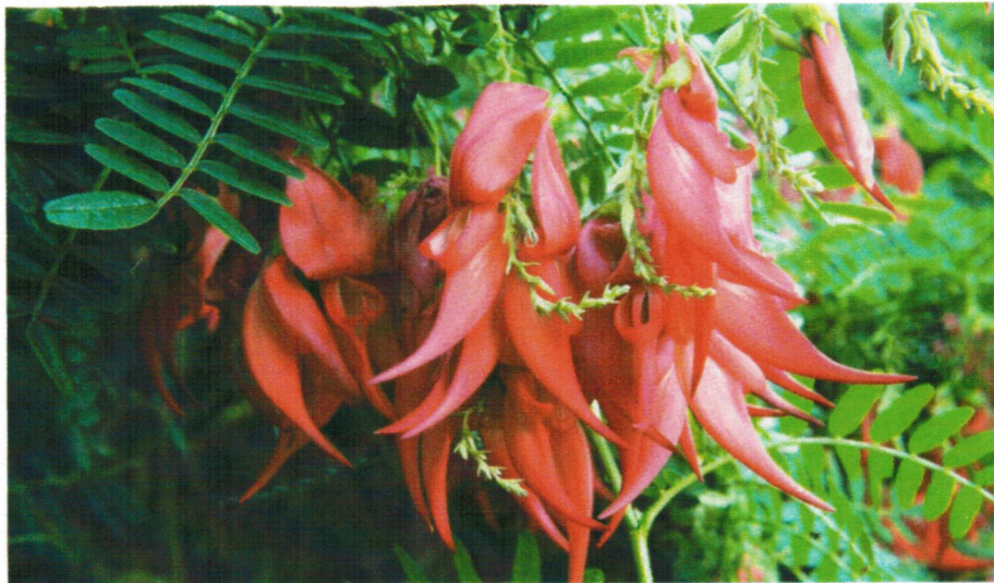
Long oblong First Light colour image with red Kakabeak