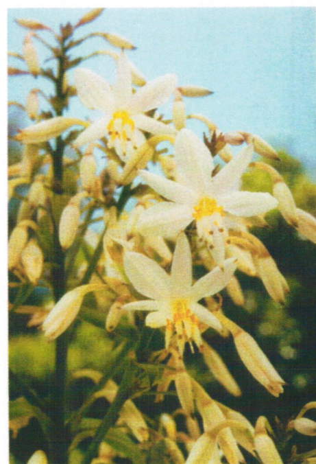
Renga Renga Lily: Comfortable expressing one's uniqueness. Demonstrative, innovative and open. Plays too hard. Has to be better than others. Always wanting the next new experience. Rebelliousness.