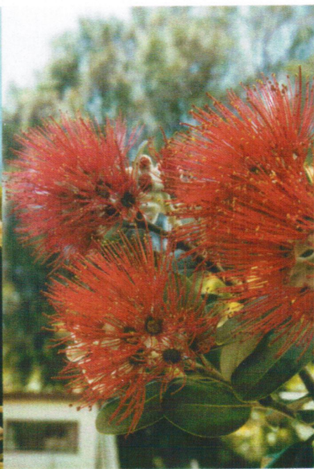
Pohutukawa: Leadership qualities and abilities, right use of power, power used with wisdom, taking the initiative. Connection with vital life force and nature power – Feels ineffective, no will to be or initiative.