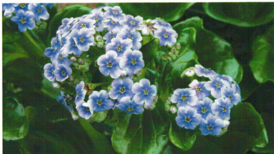
Chatham Island Forget-me-not: Finding one's place in the world. Finding joy in climbing the mountain of one's ambitions. Re-parenting oneself – issues with authority figures, rejection of parents.