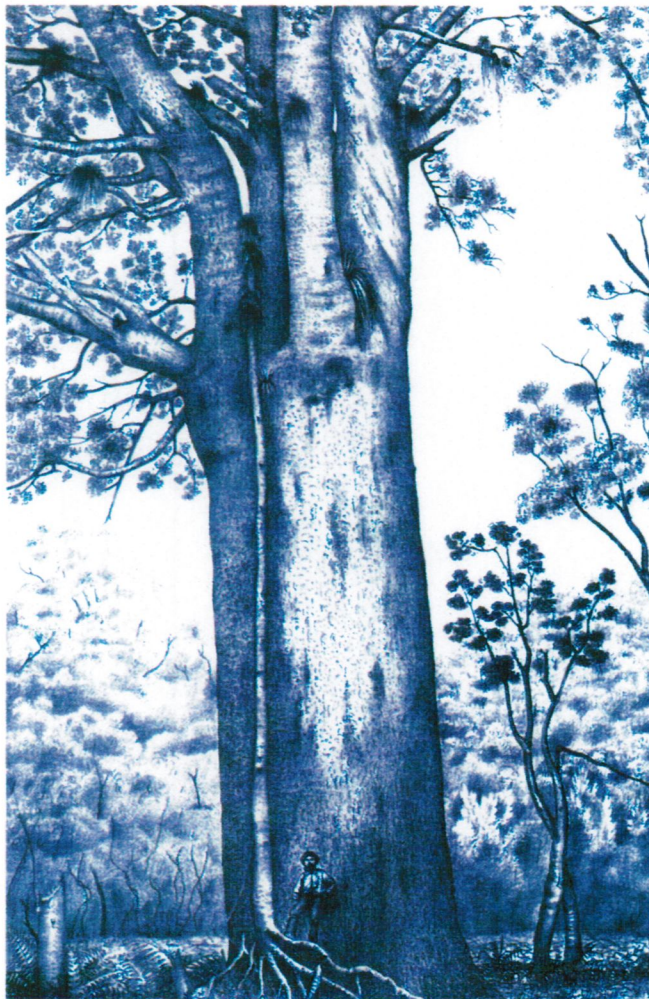
Kauri at Tararu Creek, Thames Gold Field. (46 feet in circumference).

This isolation and total absence of human habitation is also one of the